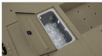
Bow 15-gal. aerated livewell