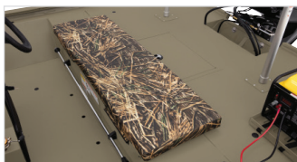
Padded helm cushion