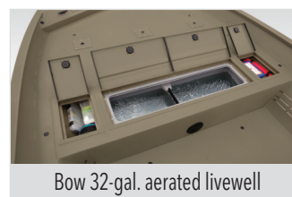
Bow 32-gal. aerated livewell

Photographs may be shown with optional equipment and/or aftermarket accessories.