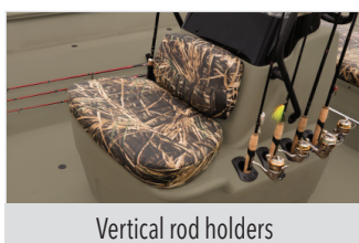
Vertical rod holders