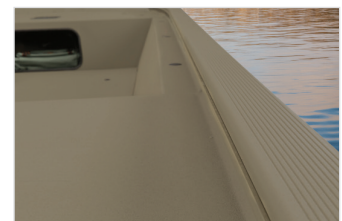
VERSATRACK® accessory-mounting channels