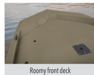
Roomy front deck