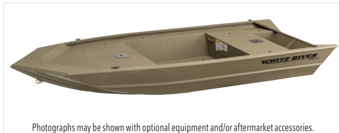
Photographs may be shown with optional equipment and/or aftermarket accessories.