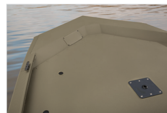
Roomy front deck