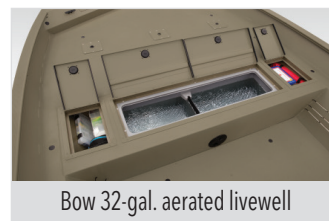
Bow 32-gal. aerated livewell

Photographs may be shown with optional equipment and/or aftermarket accessories.